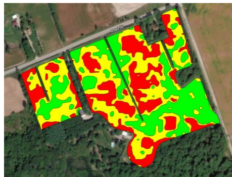
Management Zones Created or VR Seed or Nitrogen