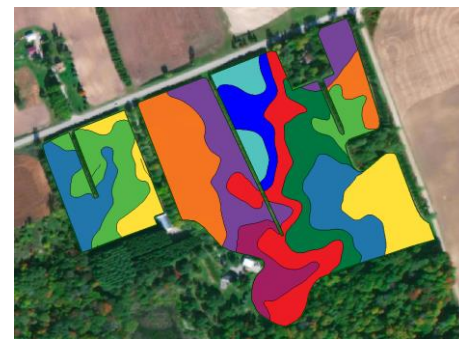
Zones for Increased Soil Management Zone Sampling & VR Fertilizer Application